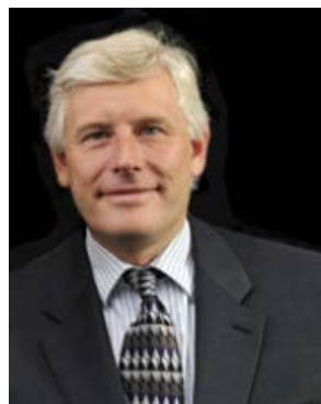
Ian Sanne International VC